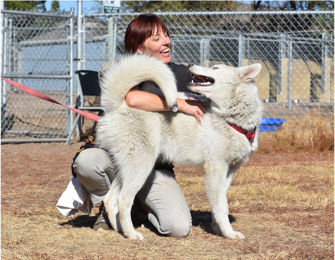
Humane Society of Weld County | www.weldcountyhumane.org

1484 Humane Society of the Pikes Peak Region 719-473-1741 www.hsppr.org