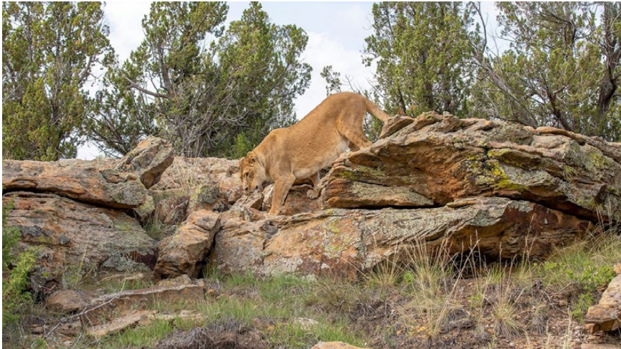
The Wild Animal Sanctuary | www.wildanimalsanctuary.org