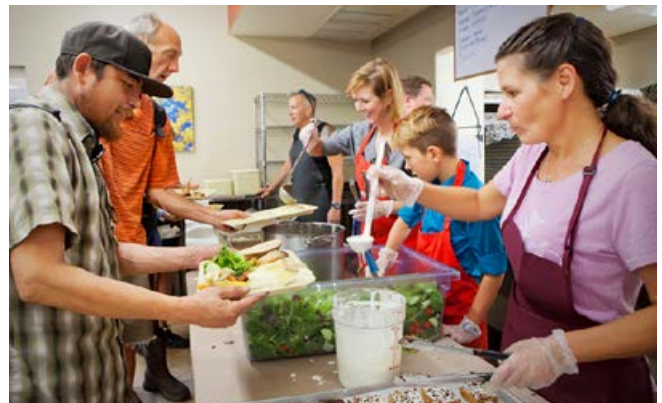
Manna | www.mannasoupkitchen.org (see page 33)