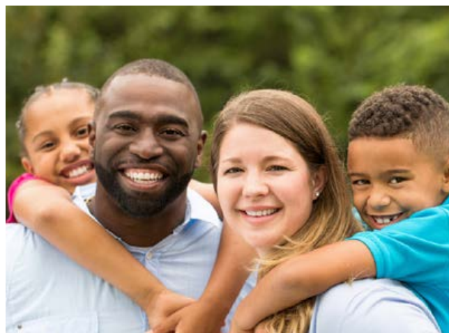
Aurora Mental Health Center | www.aumhc.org (see page 38)