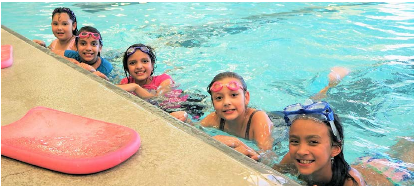
Riverside Educational Center | www.rec4kids.com (see page 21)