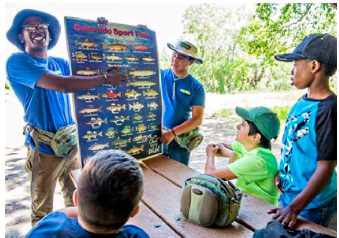
Environmental Learning for Kids | www.elkkids.org (see page 12)