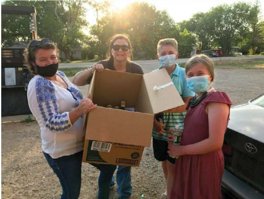
La Plata Family Centers Coalition | www.lpfcc.org