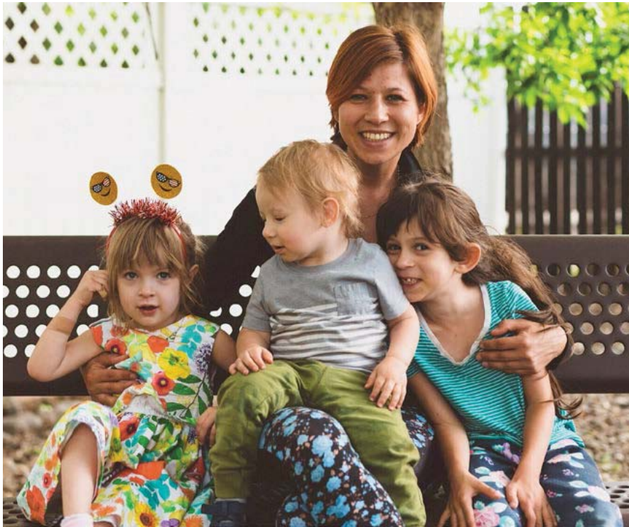
Beyond Home | www.coloradohomelessfamilies.org

2500 United Way of Morgan County 970-867-2218 www.mcunitedway.org