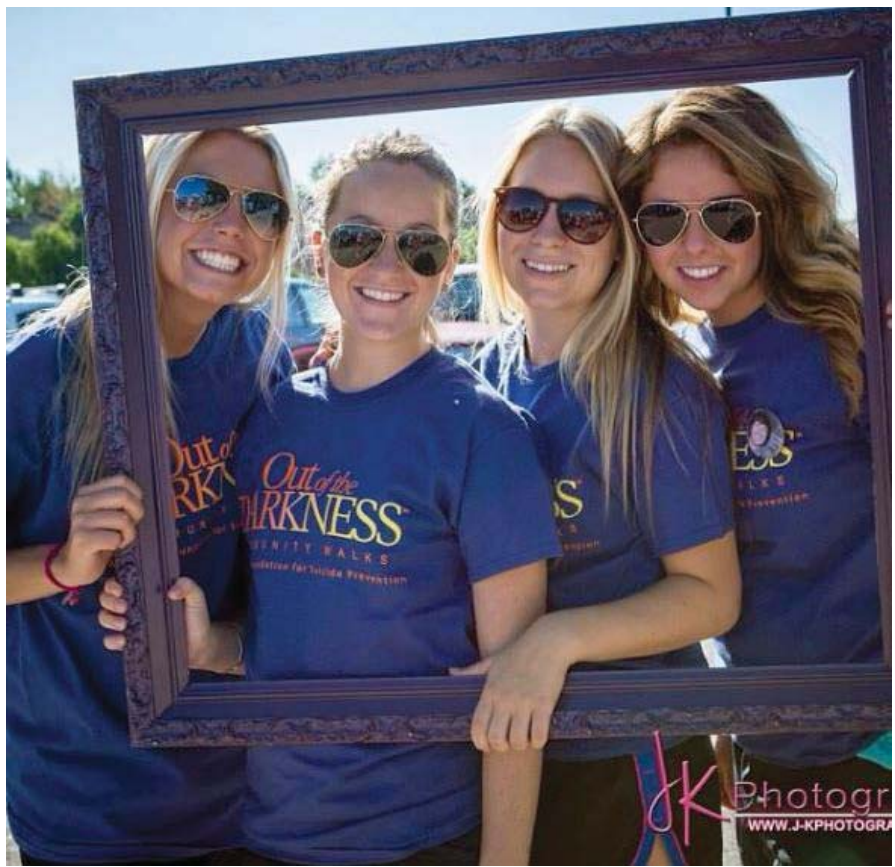
American Foundation for Suicide Prevention | www.afsp.org