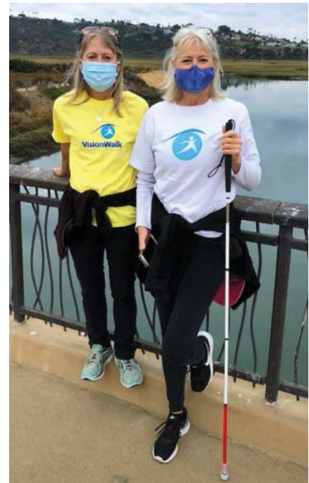
Foundation Fighting Blindness www.FightingBlindness.org