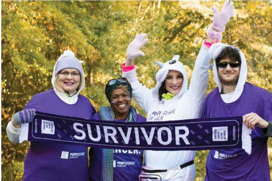
Pancreatic Cancer Action Network | www.pancan.org