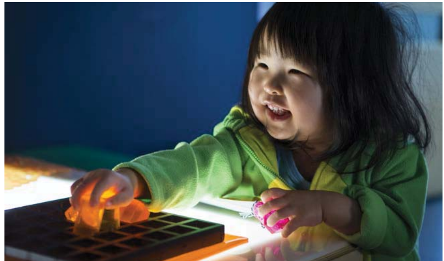
Anchor Center for Blind Children | www.anchorcenter.org